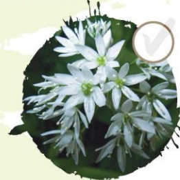
Ramsons (wild garlic) See it: April–May