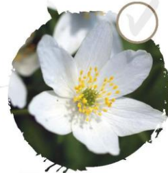
Wood anemone See it: March–May