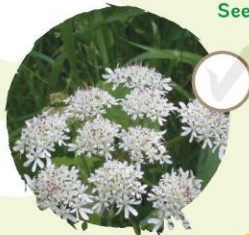
Cow parsley See it: May–June