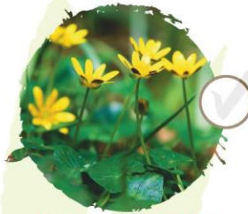
Lesser celandine See it: March–May