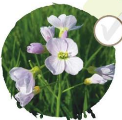
Cuckooflower See it: April–June