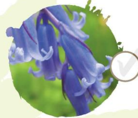
Bluebell See it: April–May