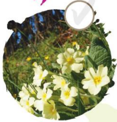
Primrose See it: December–May

Bright colours and delicate petals How many will you spot?