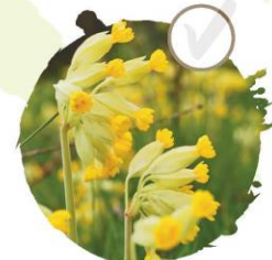
Cowslip See it: April–May