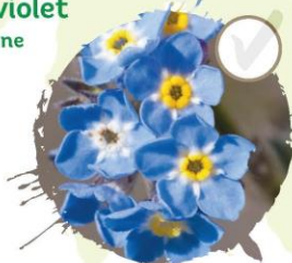
Wood forget-me-not See it: April–June