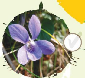
Common dog violet See it: April–June