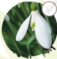
Snowdrop See it: January–March