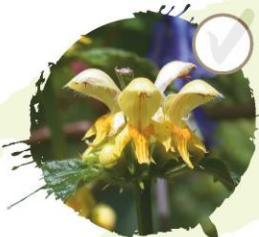
Yellow archangel See it: May–June