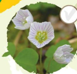
Wood sorrel See it: April–May