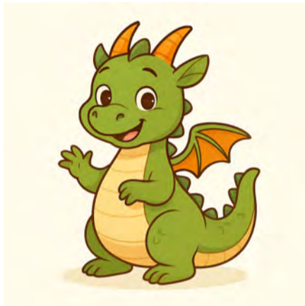
A Friendly Dragon