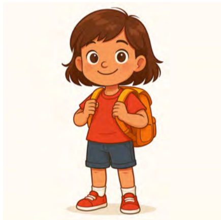
A Curious Child