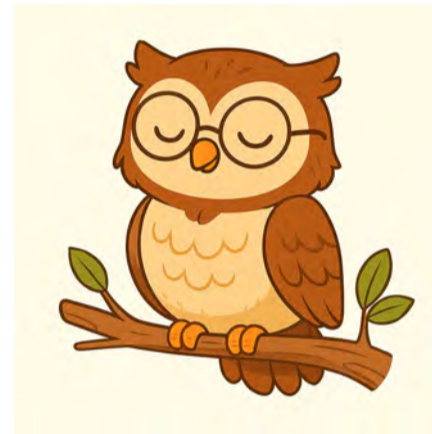
A Wise Owl