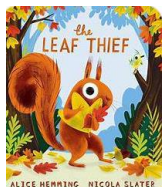
The leaf thief